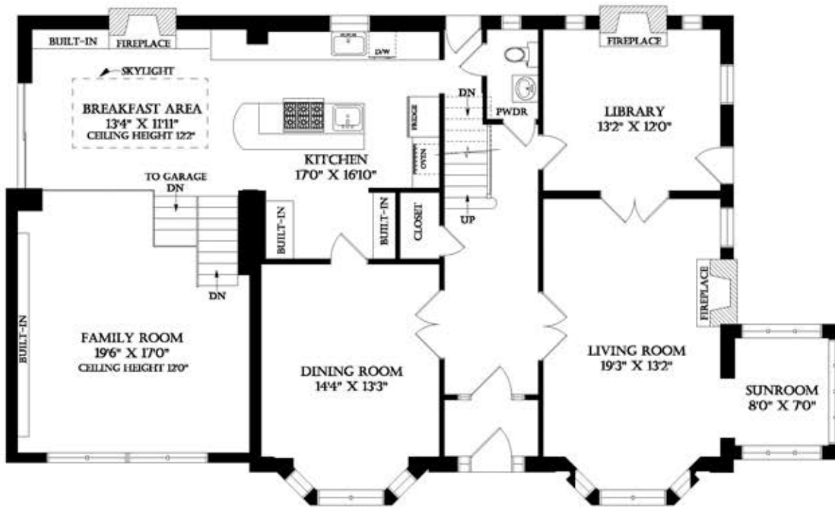
MAIN FLOOR 1939 SQUARE FEET