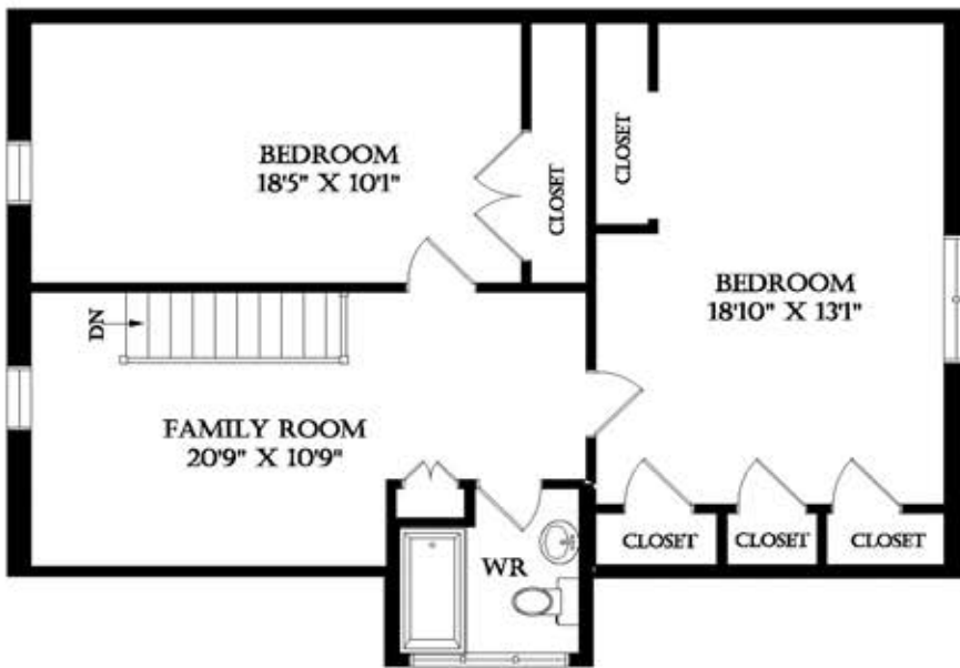
THIRD FLOOR 829 SQUARE FEET